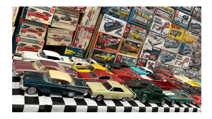
This table holds built and unbuilt model kits. The unbuilt kits on the right are fairly recent (less that 20 years old), while the kits on the left date from the '60s.