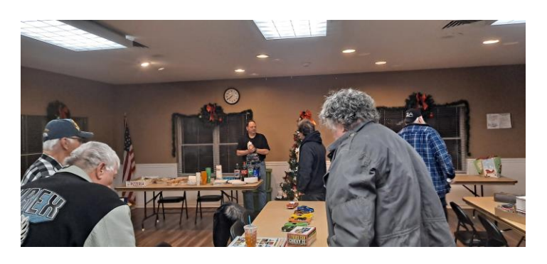
Works of art from yours truly